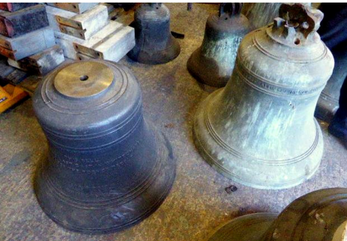
The photos show the new and the old treble, and one of the inscriptions on the new treble.